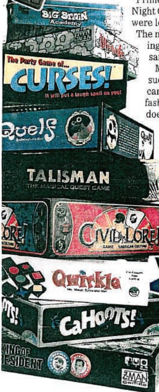
Popular new board games this year cover a wide range of genres, skills, interests and age levels.