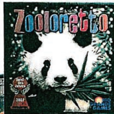
Zooloretto received the prestigious German Game of the Year award.